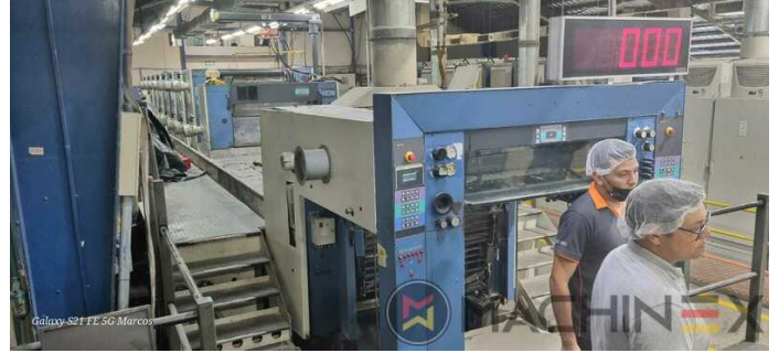
Galaxy S21 FE 5G Marcos