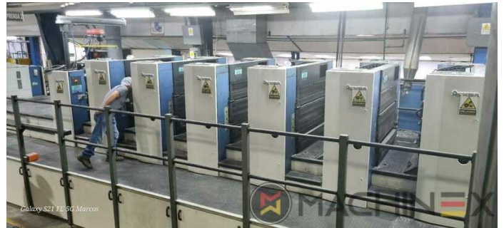
Galaxy S21 FE 5G Marcos