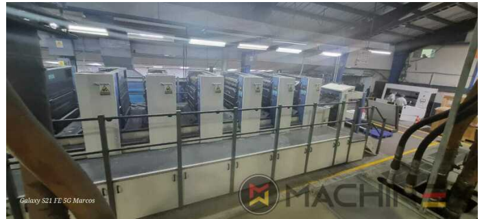
Galaxy S21 FE 5G Marcos