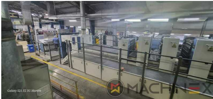
Galaxy S21 FE 5G Marcos