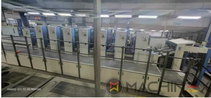
Galaxy S21 FE 5G Marcos