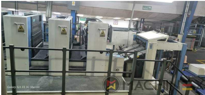
Galaxy S21 FE 5G Marcos