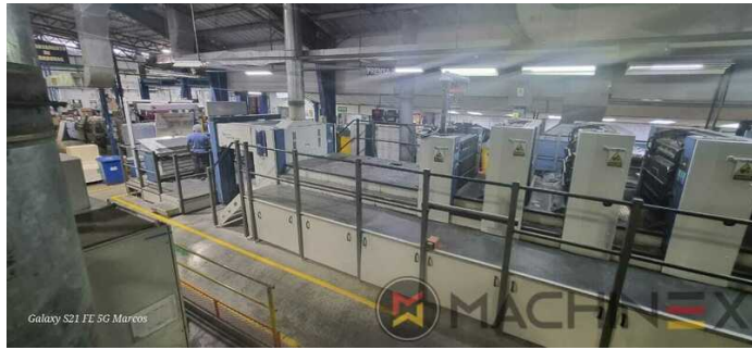
Galaxy S21 FE 5G Marcos