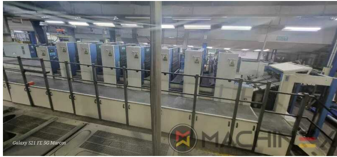
Galaxy S21 FE 5G Marcos