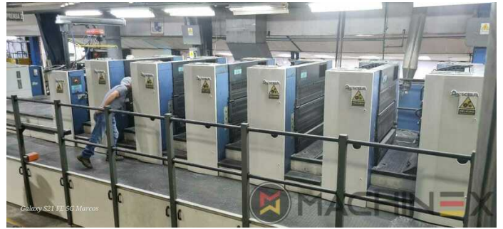
Galaxy S21 FE 5G Marcos