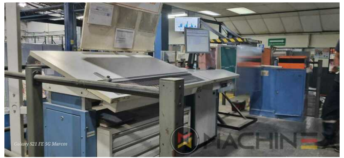
Galaxy S21 FE 5G Marcos