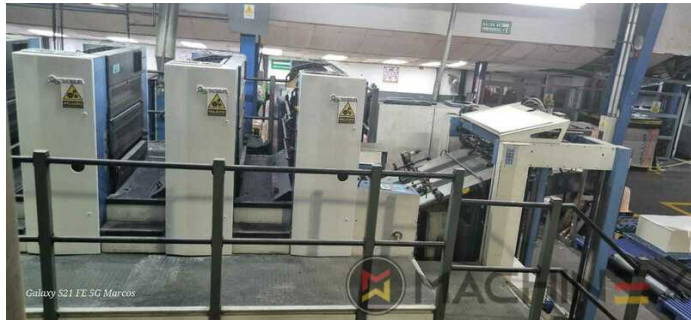
Galaxy S21 FE 5G Marcos