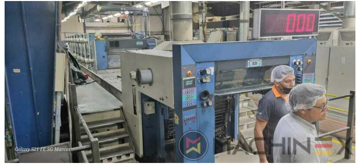
Galaxy S21 FE 5G Marcos