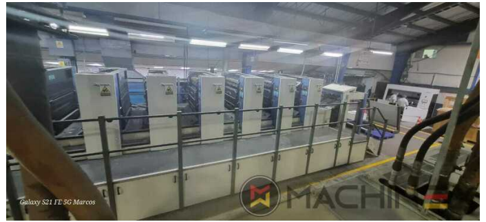
Galaxy S21 FE 5G Marcos