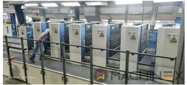
Galaxy S21 FE 5G Marcos