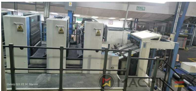
Galaxy S21 FE 5G Marcos