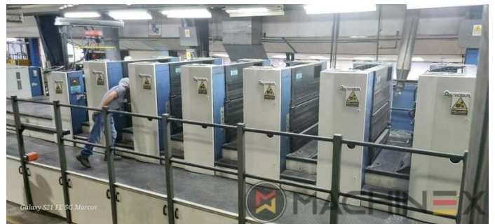
Galaxy S21 FE 5G Marcos