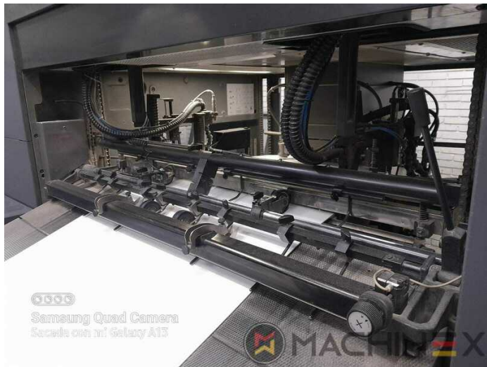
©©©© Samsung Quad Camera Sacada con mi Galaxy A13