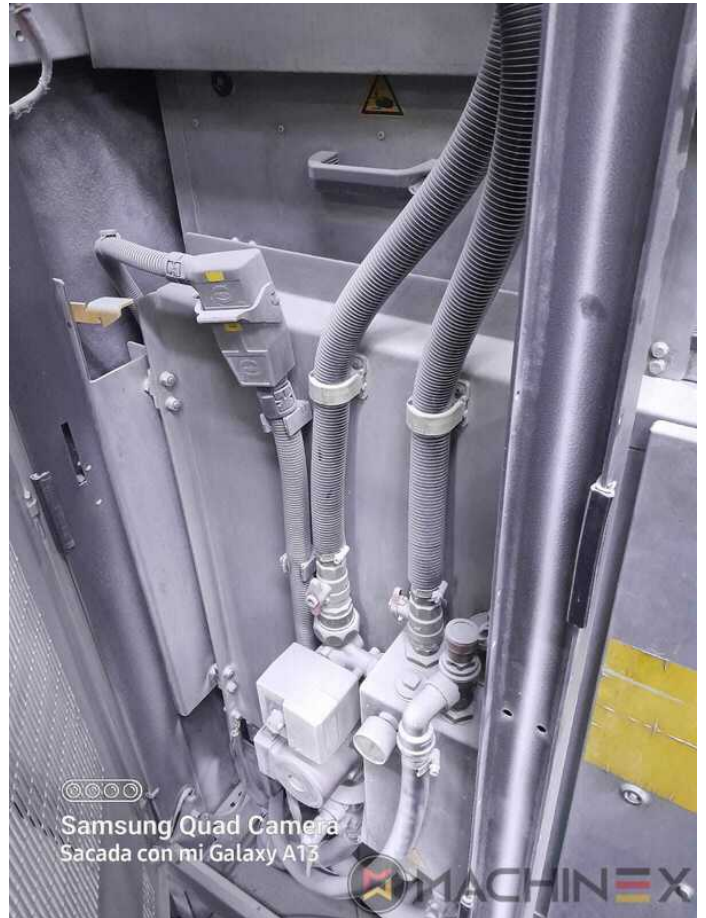
©©©© Samsung Quad Camera Sacada con mi Galaxy A13