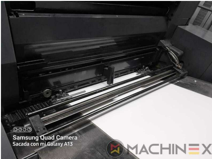
©©©© Samsung Quad Camera Sacada con mi Galaxy A13