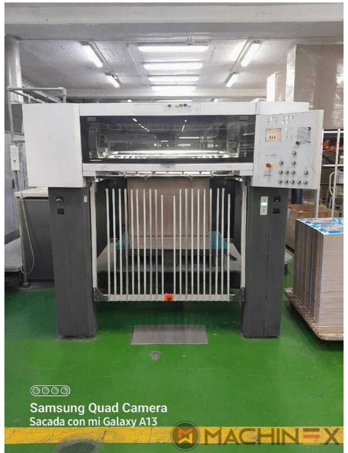
©©©© Samsung Quad Camera Sacada con mi Galaxy A13