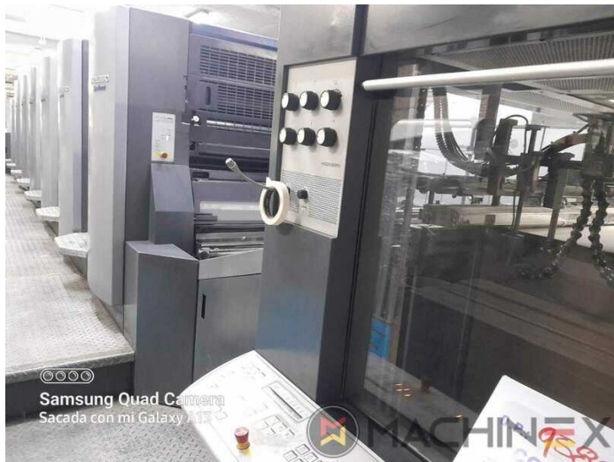
©©©© Samsung Quad Camera Sacada con mi Galaxy A13