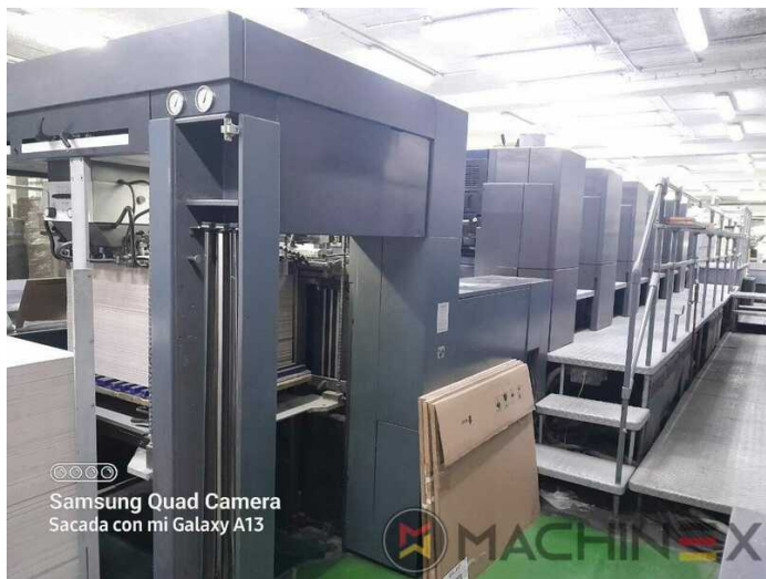
©©©© Samsung Quad Camera Sacada con mi Galaxy A13