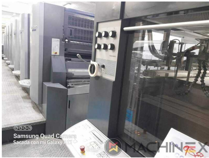
©©©© Samsung Quad Camera Sacada con mi Galaxy A13