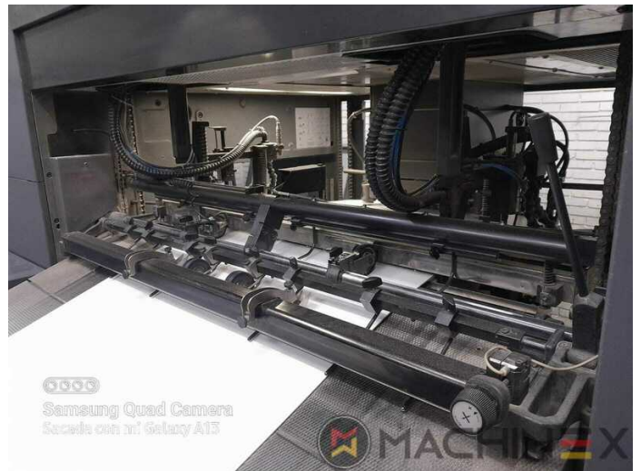
©©©© Samsung Quad Camera Sacada con mi Galaxy A13