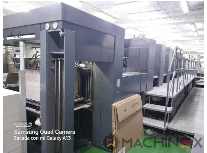
©©©© Samsung Quad Camera Sacada con mi Galaxy A13