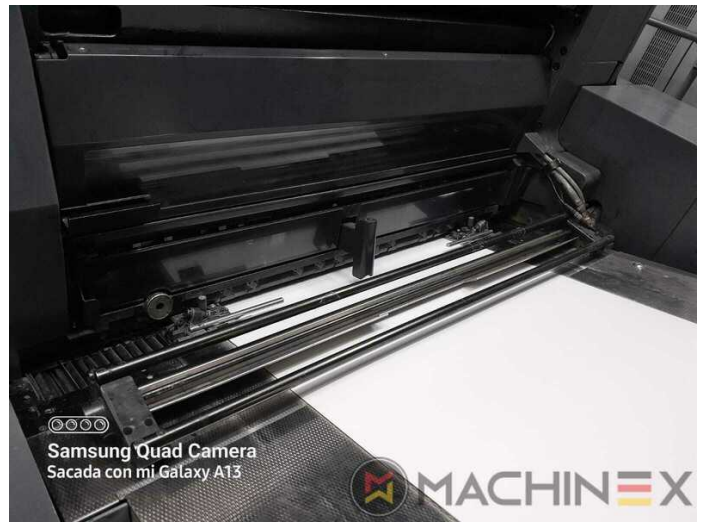
©©©© Samsung Quad Camera Sacada con mi Galaxy A13